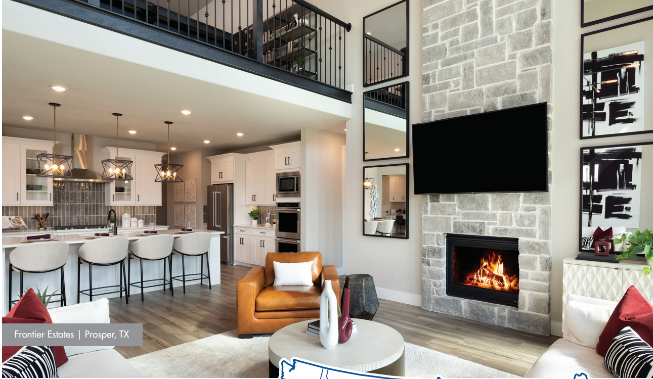
Frontier Estates | Prosper, TX