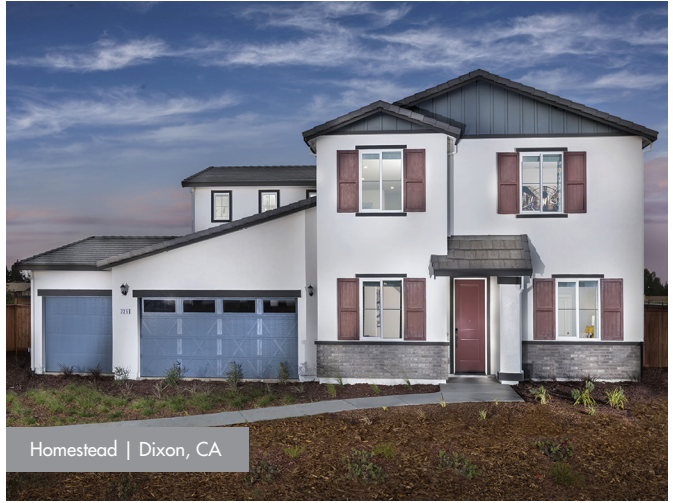
Homestead | Dixon, CA