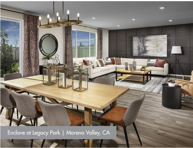
Enclave at Legacy Park | Moreno Valley, CA