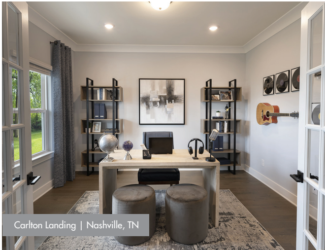
Carlton Landing | Nashville, TN