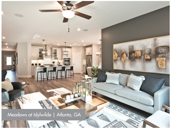
Meadows at Idylwilde | Atlanta, GA