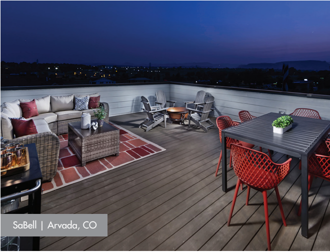
SaBell | Arvada, CO