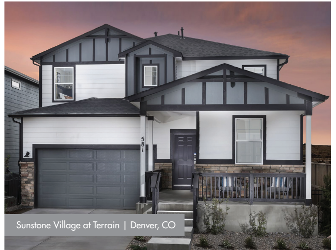
Sunstone Village at Terrain | Denver, CO