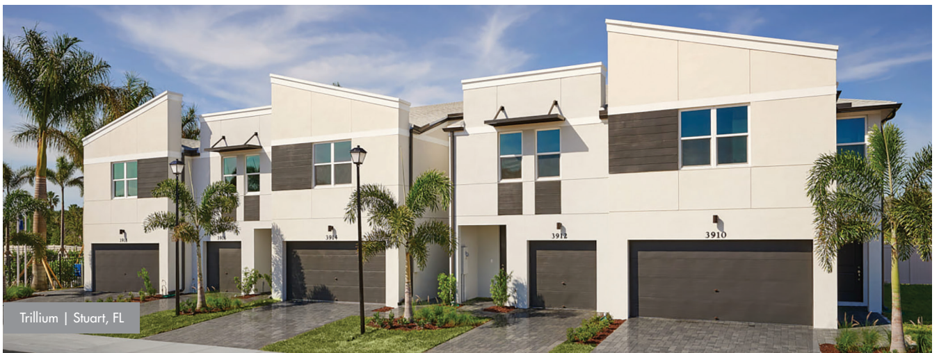
Trillium | Stuart, FL